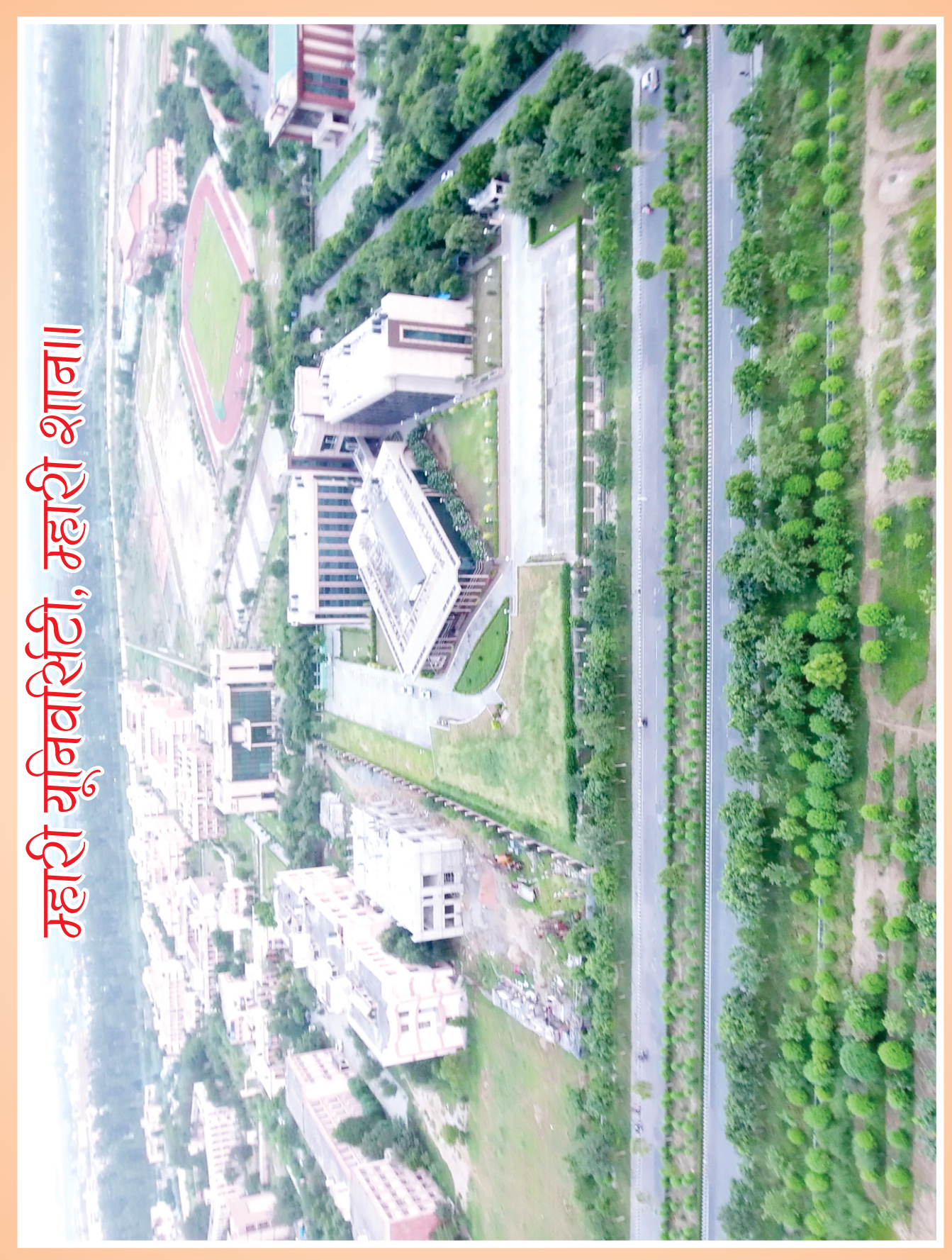
H-1273-300, MDU Press