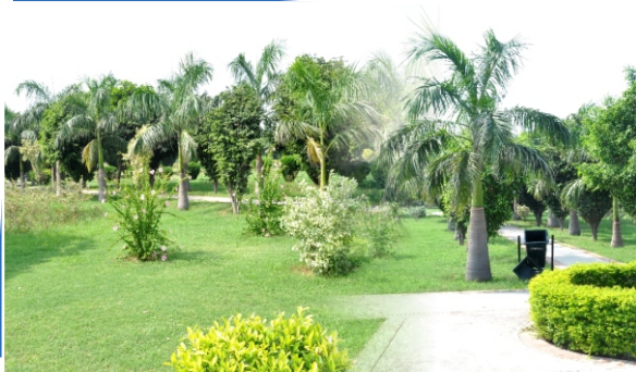
Landscape of MDU