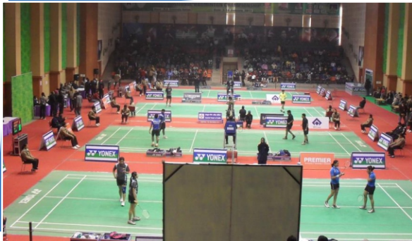
Indoor Sports Activity