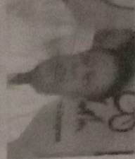
WEST BENGAL BJP ON THURSDAY WROTE TO THE STATE LEGISLATIVE ASSEMBLY SECRETARY DEMANDING REJECTION OF THE NOMINATION OF PAC LEADER MUKUL ROY FOR PUBLIC ACCOUNTS COMMITTEE MEMBERSHIP

KOLKATA: West Bengal BJP on Thursday wrote to the state Legislative Assembly Secretary demanding rejection of the nomination of PAC leader Mukul Roy for Public Accounts Committee membership. "We vehemently object during the scrutiny of the nomination paper of Mukul Roy in the Public Accounts Committee verbally and are now expecting our strong objection to be accepted by the