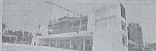
The inauguration of the first state-of-the-art bus stand in Faridkot.

Deciding a new milestone in the public transport sector, the state Transport