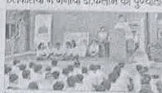
हलवशिये ने अनादी डाकतम की पुष्पखिधि... (Caption describing the image above.)

हलवशिये ने अनादी डाकतम की पुष्पखिधि... (Text discusses the protest and the government's response.)