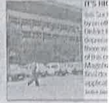
The court rapped the District Magistrate for approving a clerk's no-objection certificate (NOC) for the construction of a residential building in Rewari.

The court said the DM had not followed the procedure laid down in the Haryana Municipal Corporation Act, 1956. The court said the DM had not followed the procedure laid down in the Haryana Municipal Corporation Act, 1956.