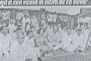
सिधेई-ईरि का दूरपयता कर विषय की सावधान रीती सरकार... (Caption describing the image above.)

सिधेई-ईरि का दूरपयता कर विषय की सावधान रीती सरकार... (Text reports on the government's cautious approach regarding the Sidhe-Idri project.)