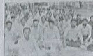
कांग्रेसियों ने प्रदर्शन कर जताया रोष... (Caption describing the image above.)

तौनमा गांधी स री की पूछताछ का मतयमा कांग्रेसियों ने प्रदर्शन कर जताया रोष... (Text describes the protest organized by Congress members against the questioning of Mahatma Gandhi.)