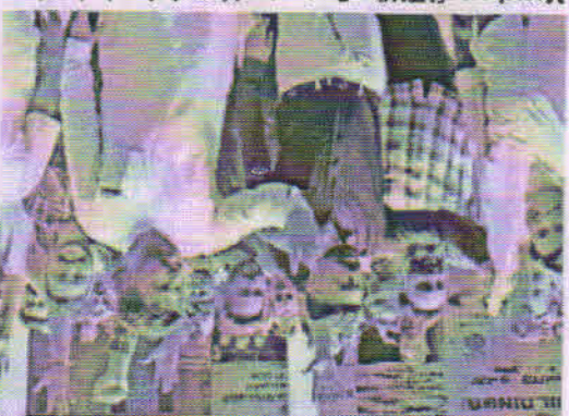
Members of UT Wine Contractors' Association during the protest in Sector 17, Chandigarh, on Wednesday