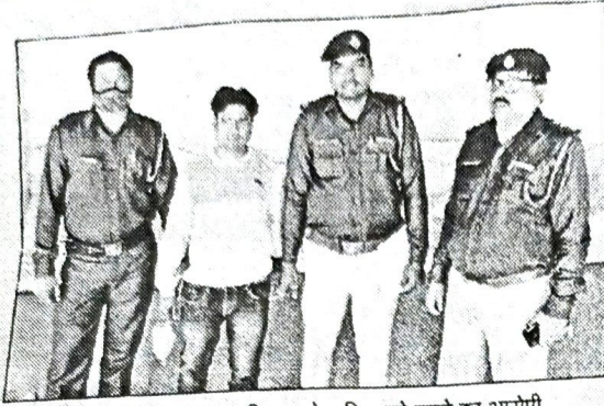
दिल्ली पुलिस बनकर हरियाणा के पुलिस को ठगने का आरोपी पल्ला थाना पुलिस की गिरफ्त में।