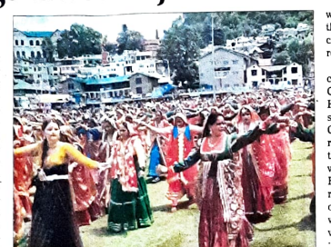
Women perform a folk dance at the Minjar Mela on Sunday.

Himachal Pradesh Governor Rajendra Vishwanath Arlekar today inaugurated a week-long Minjar Mela at the historic Chowgan in Chamba. He said the glorious history and rich folk traditions of the state were playing a vital role in the progress of the state. This was Arlekar's first visit to Chamba as Governor. He said the historical Minjar Mela had its own identity. Expressing happiness over the preservation and promotion of the district's rich folk art and culture and maintaining social harmony, he stressed upon the inclusion of modernity in the successful organisation of the fair. "Chamba has a rich folk culture. This culture is being preserved by the people since time immemorial. The traditional folk art and social harmony should be preserved," he said. Arlekar also talked about famous artworks of the district — Chamba Rumal and Chamba Chappal. He said the state government was taking necessary steps to accord the status of international fair to the Minjar Mela.