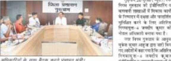
अधिकारियों को सौपी जिम्मेदारियां

गुरुग्राम, 26 जुलाई (ब्यूरो): पंचायत मंत्री ने ग्रामीण विकास योजनाओं की समीक्षा की। पंचायत मंत्री ने ग्रामीण विकास योजनाओं की समीक्षा की। पंचायत मंत्री ने ग्रामीण विकास योजनाओं की समीक्षा की।