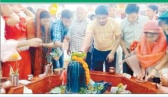
विशाल भण्डारों व मेलों का हुआ आयोजन

गुरुग्राम, 26 जुलाई (अ.प्र.): शहर के मंदिरों में शिवभक्तों का लगा रहा तांता। शिवभक्तों का लगा रहा तांता। शिवभक्तों का लगा रहा तांता। शिवभक्तों का लगा रहा तांता।