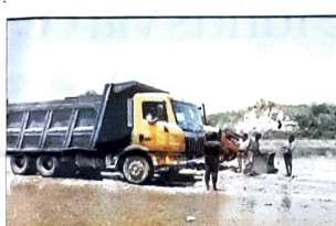
Illegal mining in progress on the banks of Swan in Una. FILE PHOTO

In a report submitted to the monitoring committee set by the NGT to suggest measures for checking illegal mining in the river, the district administration of Una has maintained that 60 leases have been granted for mining in the Swan. These include 28 to stone crushers and 32 as open mining leases from where the lessee can extract the minerals and sell these in open market. Of the 60, 52 leases have been granted on private lands on the Swan riverbed and eight on government land. People living at Bathri on the borders of Punjab and Himachal are alleging that the mining mafia is destroying their lands by mining in the middle of night. Officials blame it on undermanned borders of both states.