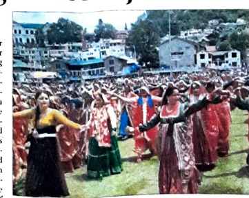
Women perform a folk dance at the Minjar Mela on Sunday.