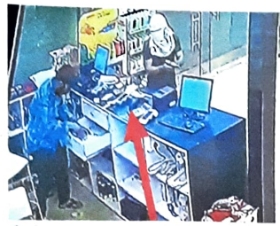
पुलिस चौकी से महज सौ मीटर दूर शराब का ठेका लूटा