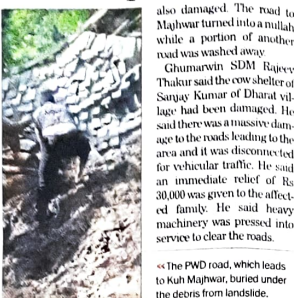
The PWD road, which leads to Kish Mahwaj, buried under the debris from landslide.

Heavy loss to government and private properties was reported following a landslide in a Dhara village of Bilaspur today. The loss to livestock was also reported by the District Disaster Management Authority. A cow shelter was destroyed where two buffaloes and 12 goats were buried under the debris of landslide that occurred after heavy rain in Kish Mahw gram panchayat in Ghumawat subdivision in Bilaspur today.