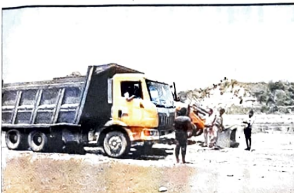
Illegal mining in progress on the banks of Swan in Una. FILE PHOTO

In a report submitted to the monitoring committee set by the NGT to suggest measures for checking illegal mining in the river, the district administration of Una has maintained that 60 leases have been granted for mining in the Swan. These include 28 to slurry crushers and 32 as open mining leases from where the lessee can extract the minerals and sell these in open market. Of the 60, 52 leases have been granted on private lands on the Swan riverbed and eight on government lands on the borders of Punjab and Himachal are alleging that the mining mafia is destroying their lands by mining in the middle of night. Officials blame it on undemarcated borders of both states. Una district has become the hub of illegal mining as most of the material mined from the district flows to Punjab and Haryana.