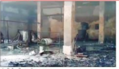
कंपनी में लगी आग में जला सागान।

बहरामपुर स्थित फैक्ट्री में हुई घटना में कोई हताहत नहीं, एक घंटे में पाया काबू