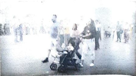
Visitors enjoy the nice weather at the Budge in Shimla on Sunday.

Narsanda recording a low of 12.8 degree C was noted at night while Dhuala Kuan was hottest during the day with a high of 34.4 degree C.