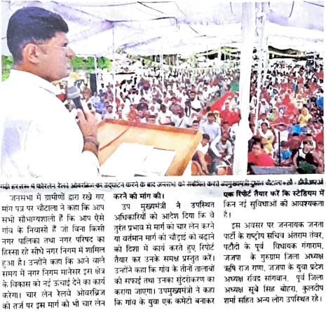
उप मुख्यमंत्री ने किया गद्दी हरसरु में चार लेन के रेलवे ओवरब्रिज का उद्घाटन

जयपुरा सड़कक मुरुगम उपमुख्यमंत्री दुष्यंत चौटाला ने कहा कि जिस प्रकार से केन्द्रिय सरकार परिवहन तथा रासामग मंत्री निमित्त गडकी पूरे देश में सड़क को का जाल बिछा रहे हैं, उसी तर्ज पर प्रदेश सरकार भी हरियाणा में जंग सड़को के निर्माण निमित्त गुरुगम सड़को के जीर्णोद्धार का कार्य करवा रही है। उन्होंने कहा कि सड़क किस्मो को क्षेत्र के विकास का मुख्य कारक होता है। उपमुख्यमंत्री ने यह बातें संविधान को याद गद्दी हरसरु में नवनिर्मित चार लेन रेलवे ओवरब्रिज के उद्घाटन के दौरान आयोजित एक जनसभा में कही। उन्होंने कहा कि करीब 6.3 करोड़ रुपये का लागत में बने इस चार लेन रेलवे ओवरब्रिज का शुभारंभ के दौरान नवनिर्मित चार लेन रेलवे ओवरब्रिज के उद्घाटन के दौरान आयोजित एक जनसभा में कही। उन्होंने कहा कि करीब 6.3 करोड़ रुपये का लागत में बने इस चार लेन रेलवे ओवरब्रिज का शुभारंभ के दौरान नवनिर्मित चार लेन रेलवे ओवरब्रिज के उद्घाटन के दौरान आयोजित एक जनसभा में कही।