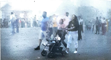
Tourists enjoy the misty weather at the Ridge in Shimla on Sunday.

Narkanda recording a low of 12.8 degree C was coldest at night while Dhulau Kuan was hottest during the day with a high of 34.4 degree C.