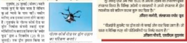
ड्रोन को रोकें और वरु क्लिब ड्रोन ट्रावेल पर परीक्षण करें।

ड्रोन से लगे हुए खाने की सामग्री, मुद्राओं में फली वार शुरू-आज, शरीर फुटल मोल्ड को रोकें और वरु क्लिब ड्रोन ट्रावेल