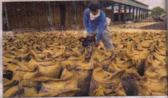
A labourer sews wheat bags at a grain market.

"The wheat procured is weighed at the godown when it is brought from the grain market. Arhtiyas are bound to fill in for the loss, if any. Of the