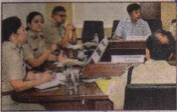
बैठक के दौरान पुलिस आयुक्त व अन्य। संवाद

पूरे जिले के अपराध को चला रहा है। उसके इस जाल को तोड़ने साथ ही अपराधियों को जेल में बंद किया जाएगा। पुलिस अधिकारियों का मानना है कि इस तरह की बैठक आगे भी होनी चाहिए। ताकि उसका लाभ मिलता रहे। इस दौरान गो तस्करी का भी मुद्दा छाया रहा। वहीं तस्करो पर भी अंकुश कैसे लगाया जाए। इसे लेकर रणनीति तैयार की जाएगी।