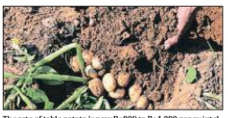
The rate of table potato is now Rs 900 to Rs 1,000 per quintal.

"No doubt the rates have improved in the past one week and they are even better than the last year when we were selling at the rate of Rs 1,200-1,300 per quintal