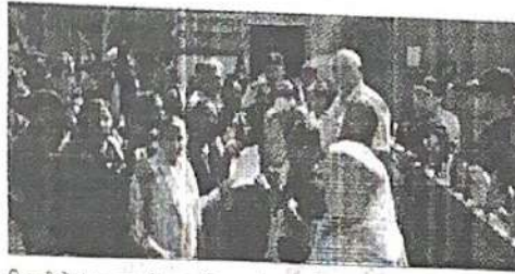
बिवाही में गंगलवार को लघु सचिवालय के बाहर ह्लापन सौपती महिलाएं।