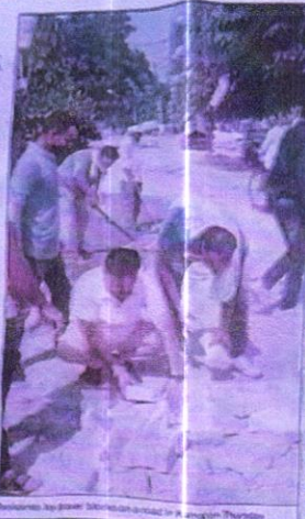
Residents lay paver blocks to make a stretch of road motorable.