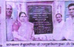
स्कूल के नवनिर्मित द्वार का लोकार्पण...