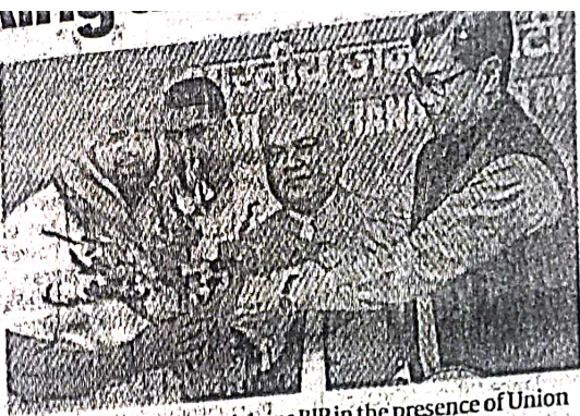
Captain Amarinder Singh joins BJP in the presence of Union ministers Narendra Singh Tomar and Kiren Rijiju at the party's head office in New Delhi on Monday.