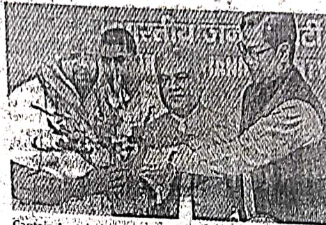
Captain Amarinder Singh joins BJP in the presence of Union ministers Narender Singh Tomar and Kiren Rijju at the party's head office in New Delhi on Monday.