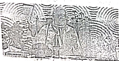
Kerala Governor Arif Mohammed Khan addresses the media at Raj Bhavan in Thiruvananthapuram on Monday.

THE MAHARASHTRA unit of Congress Monday joined several states in demanding that Rahul Gandhi return as the party president. But the meeting of the PCC general body saw some behind-the-scenes activities. Former CJI Prithvi Raj Chavan wanted to move a small resolution thanking party chief Sonia Gandhi for accepting the request of the leaders (of G-23) who had written to her in August 2020, urging the party should have a full-time president. He told Pradesh Returning Officer M M Pallam Raju that through a resolution he wanted to thank Sonia for calling elections for the top post, but Raju was hesitant. Finally, PCC delegates passed only two resolutions: one urging Rahul to take over, and a second authorising Congress chief to decide on appointment of the state chief and nominate AICC delegates.