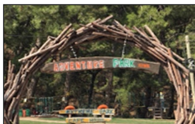
Chillout Zone Adventure Park