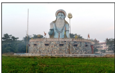
Baba Mastnath Mandir