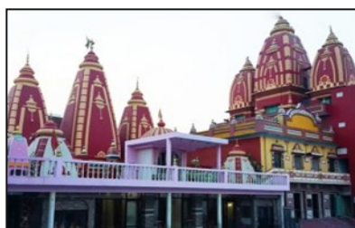
Durga Bhawan Mandir