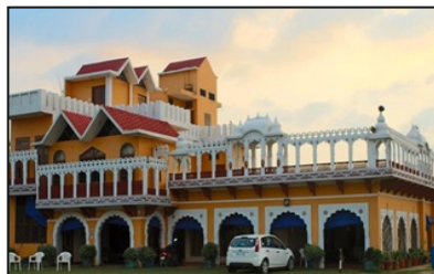
Banni Khera Farm House