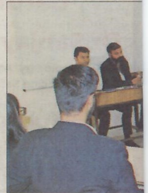
मूक कोर्ट प्रतियोगिता में भाग