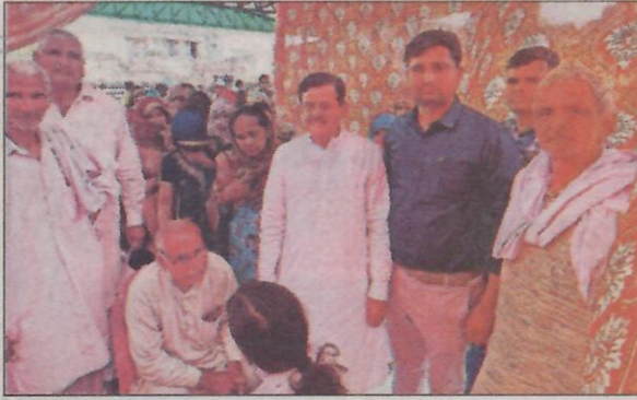
शिविर में मरीजों की जांच करते चिकित्सक।

अनुशासनात्मक अंतराष्ट्रीय संग्राम प्रारंभ हुई। एमडीयू के दृश्य क