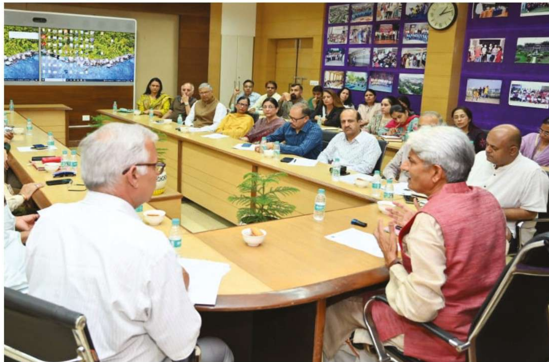
MDU MIRROR BUREAU

The IQAC Cell proactively prepared the roadmap for implementation of NEP-2020 and Institutional Development Plan in keeping with the UGC guidelines.